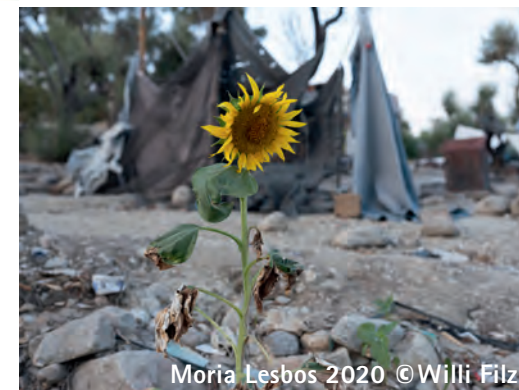
Moria Lesbos 2020

Legal advice, participation and human rights work with refugees